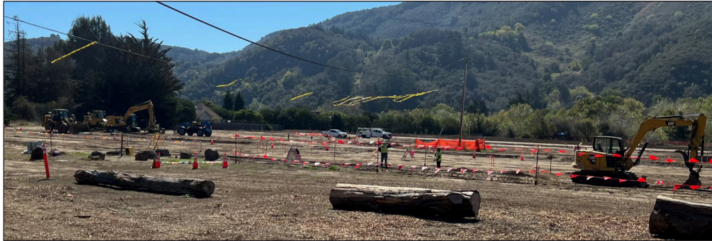
All Saints Day School is undergoing infrastructure improvements that include increasing the size and access to the parking lot, installing sewer pipes, and upgrading athletic fields with artificial turf to conserve water.

The first phase of the project will build out the eastern side of the property. Progress at the county has been slow in clearing some 200 conditions for the project, and reaching the groundbreaking stage was a significant milestone for the owners. With the main entrance located across from Brookdale Drive, the full project is planned for 73 market-rate homes and 22 affordable units. The frontage of the ranch is expected to feature an equestrian facility, and much of the 891 acres will be open space, including a trail to Jacks Peak Park. Carmel Valley Road will be widened to add a center turning lane.