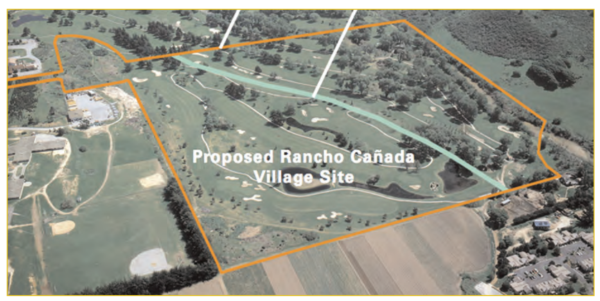
Monterey County Rancho Cañada Village Specific Plan

The proposed project has a long history beginning in 2005, with the first EIR released for public review in 2008. It has taken eight years for the county to submit a new document. The CVA team that reviewed it found it to be inadequate for the following reasons: