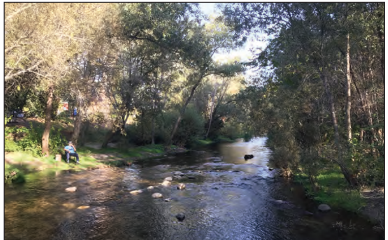
Carmel River view