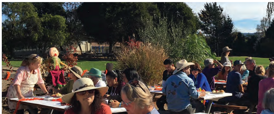
Annual Thanksgiving feast hosted by the Angel Project

The Carmel Valley Angel Project works all year to provide food, toys, clothing, books, and more at the Angel Store to our deserving families every Christmas season. Donations can be made securely online here: www.thecvap.org/