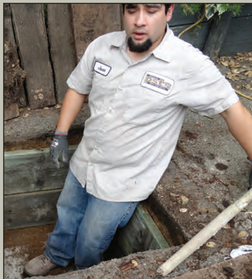
Local tank reconstruction, with a worker from Peninsula Septic Tank Service Inc.