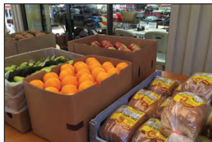
Angel Store toy and food bank